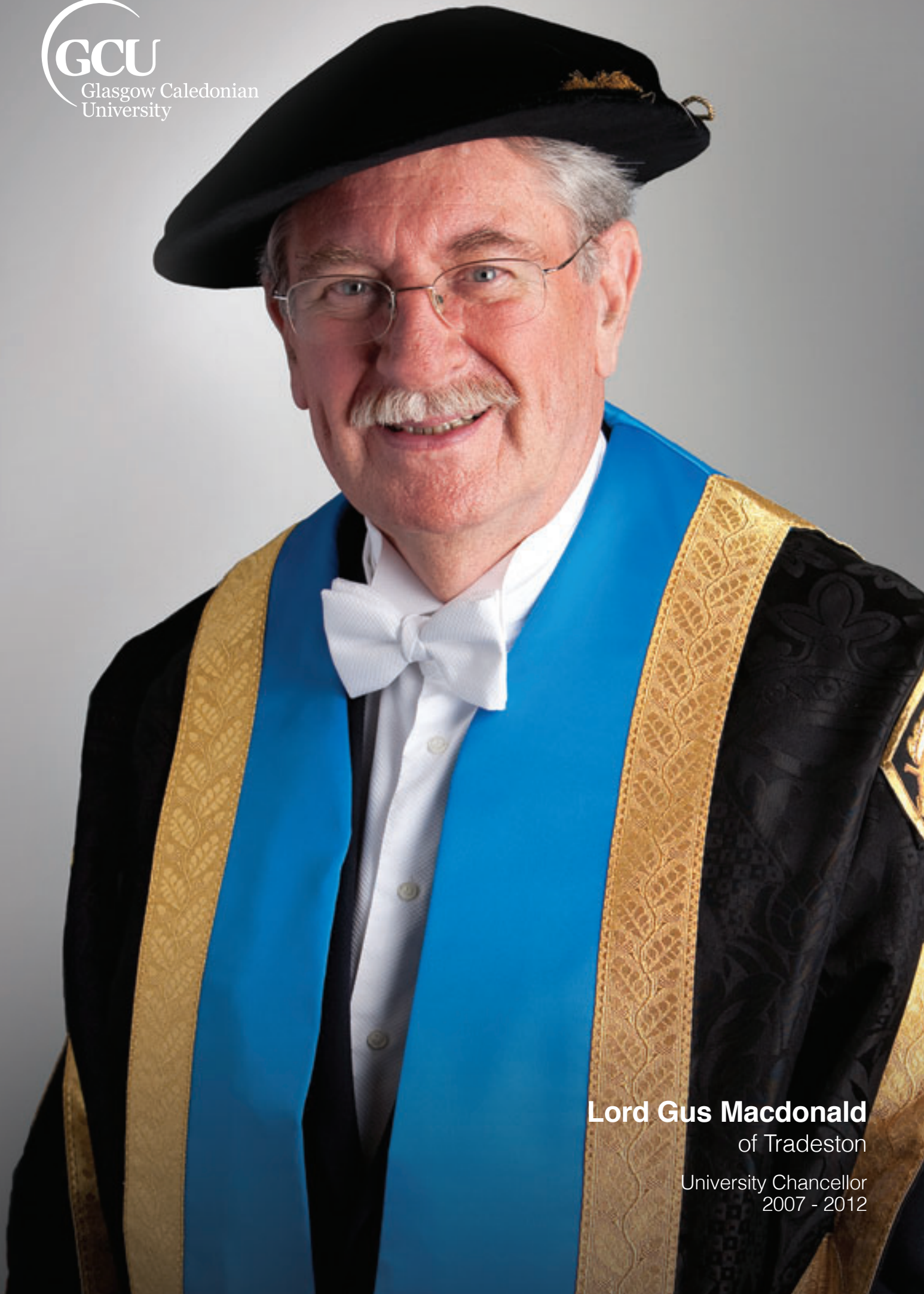
Lord Gus Macdonald of Tradeston